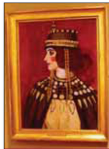
The art of Vanessa Bell and Duncan Grant

paintings Duncan and Vanessa produced which are now on display at Brighton Museum. It's very rare for Brighton residents to get a discount for anything but for this exhibition, if you take proof of address with you, it is half price at £3.00.