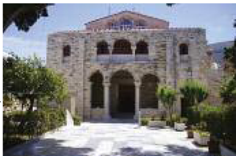
PANAYA TEMPLE, PAROS

Not having any real idea of what the Cyclades Islands had on offer, we flew to Mykonos and then took the fast ferry to Paros . Mykonos is great with its many tourists, cruise ships, boutique hotels and wonderful beaches, but Paros is a completely different place. Only an hour or so by Sea Jet and you're in another world; a truly white shiny island full of ancient history, beaches to die for, fantastic food, really lovely welcoming people, plenty of very reasonably priced hotels and of course the weather. We landed