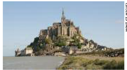
MONT ST MICHEL

country road and seeing no traffic was a very pleasant experience. You could drive for hours and be quite relaxed as there were no trucks or angry commuters in a hurry.