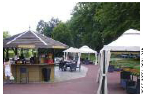
FORGE HOTEL POOL BAR